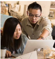
Chart your future career through the Iowa State University Undergraduate Research Assistant Program. The program offers students pursuing a graduate degree a hands-on learning experience in a formal research environment. The program encourages students to become skilled, effective independent scholars. Applications