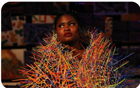
Copy and layout by Amanda Fortman

The Fashion Show provides student members with many leadership and professional development